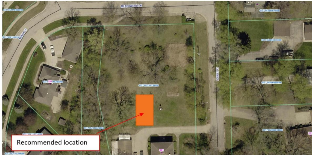
Figure 4 – Recommended Building Location

Below are the standards for Variances that the Plan Commission shall consider when making a recommendation to the City Council.