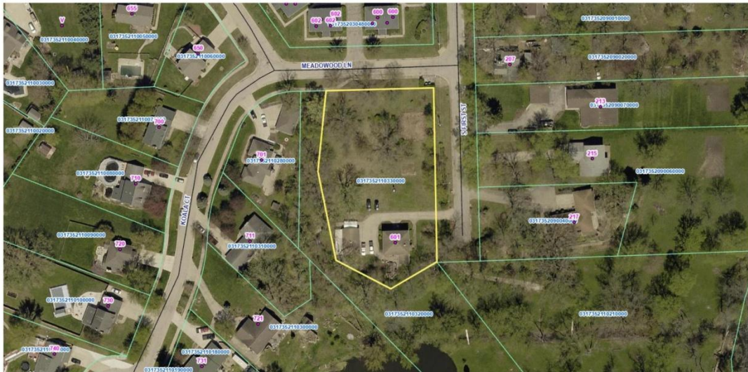
Figure 1 - Aerial

The applicant desires to construct a new detached accessory on the property in the location shown in Figure 2.