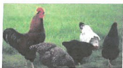
Why Join BackYard Chickens? Membership is FREE - Get Started!