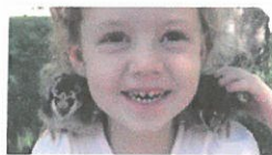
The Basics Of Raising Chickens - Raising Chickens 101