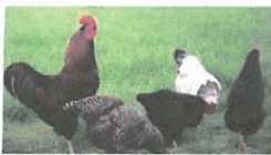
Why Join BackYard Chickens? Membership is FREE - Get Started!