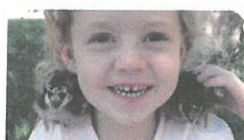
The Basics Of Raising Chickens - Raising Chickens 101

BackYard Chickens is proudly sponsored by