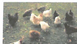
Raising Chickens on a Shoestring