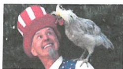
Uncle Sam Expects You To Keep Hens and Raise Chickens!!