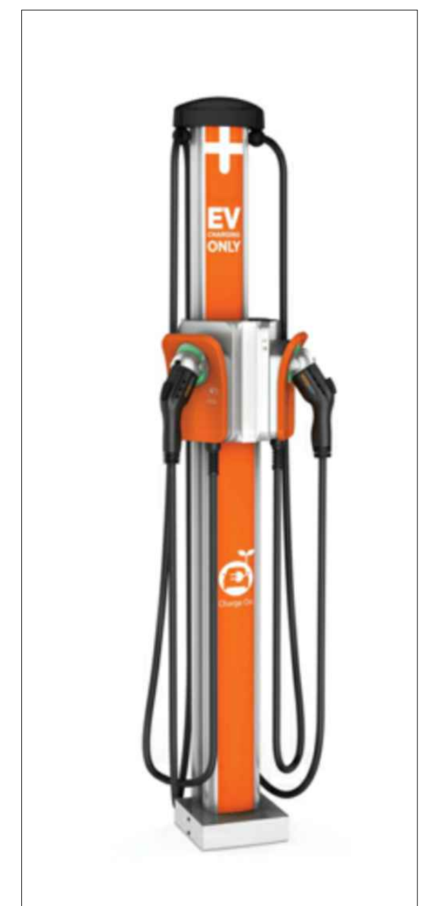
ELECTRIC VEHICLE CHARGING STATION DETAIL N.T.S.